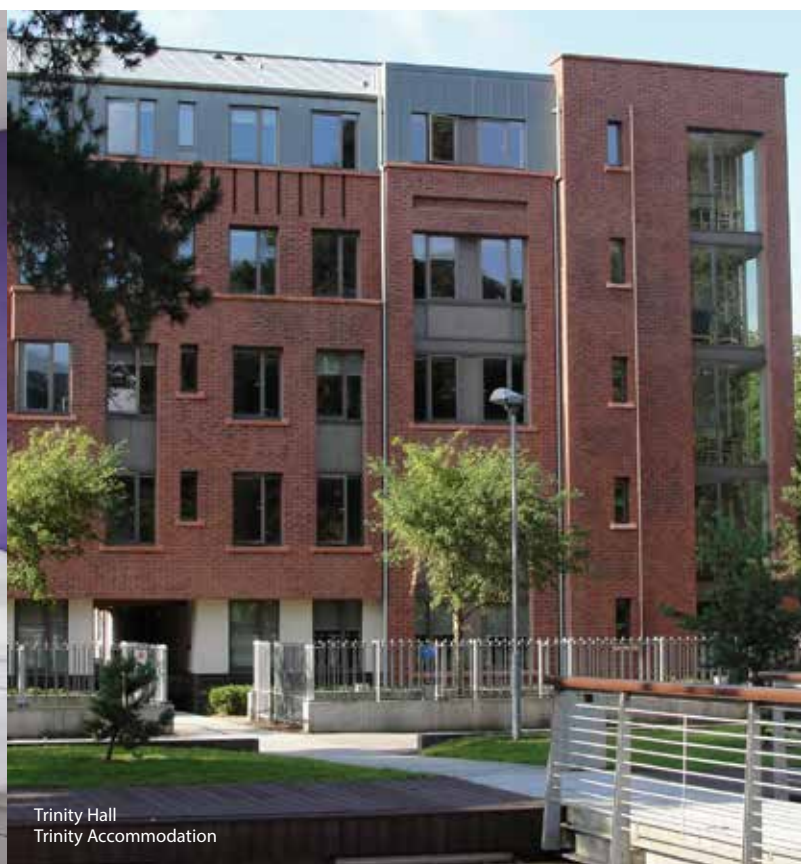
Trinity Hall Trinity Accommodation