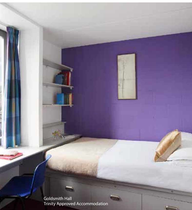
Goldsmith Hall Trinity Approved Accommodation