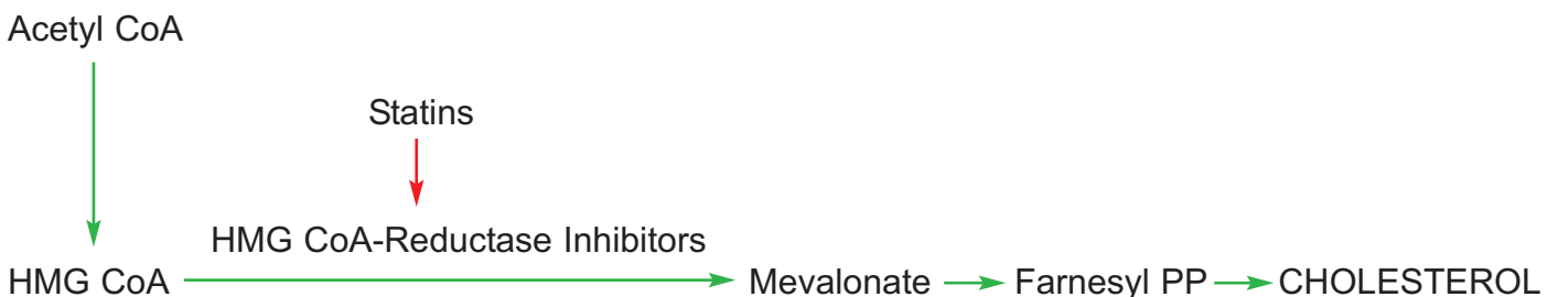
Figure 1. Schematic representation of Statin effect on Cholesterol synthesis.

Statins are structural analogues of 3-hydroxy-3-methylglutaryl-coenzyme A, and competitively inhibit the HMG-CoA reductase enzyme responsible for the first committed step in sterol biosynthesis. By reducing intracellular levels of cholesterol, the expression of LDL receptors in liver cells is up-regulated, leading to increased clearance of LDL from the bloodstream. Thus, their main effect lies in the reduction of LDL cholesterol 7 .