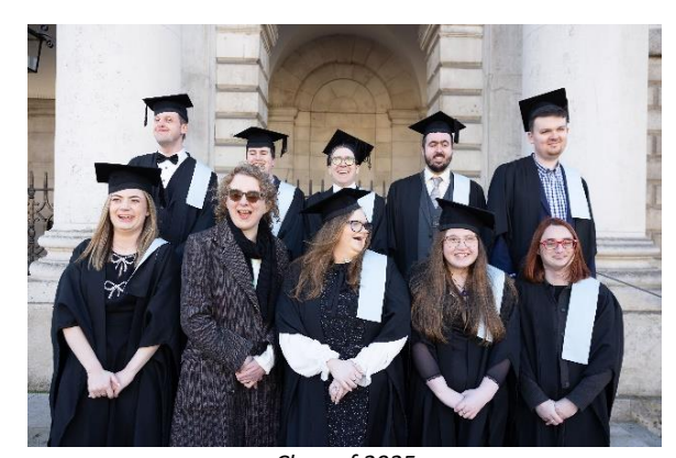
Class of 2025