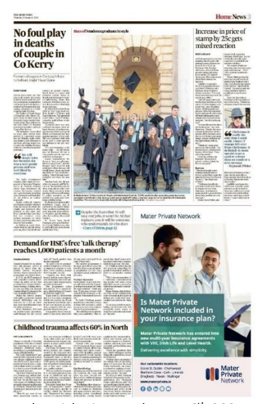
The Irish Times February 6<sup>th</sup> 2025