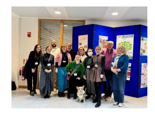
TCPID team at Inclusion in Action Conference in UCC December 2024