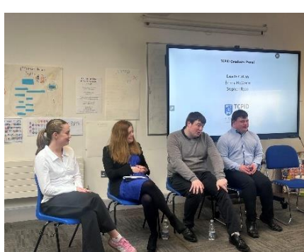
Graduate discussion panel