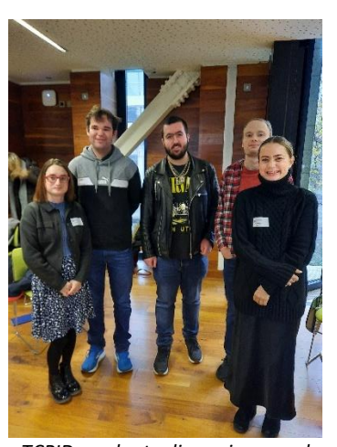
TCPID graduate discussion panel