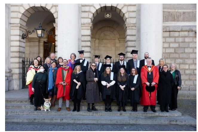
TCPID staff with the new graduates