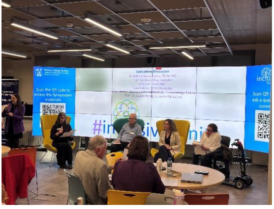
TCPID team at Trinity Inclusive Curriculum Symposium