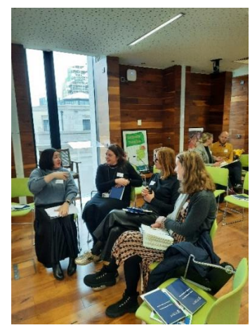
TCPID Business Partners working in groups