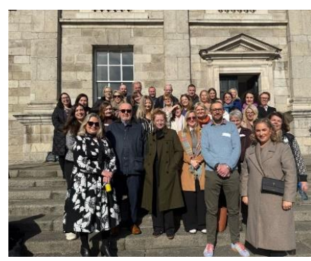
Participants at the TCPID INCLUDE-ID Network employment workshop

Many thanks also to the entire TCPID and School of Education team and the Higher Education Authority for supporting this endeavour through PATH 4 Phase 2.