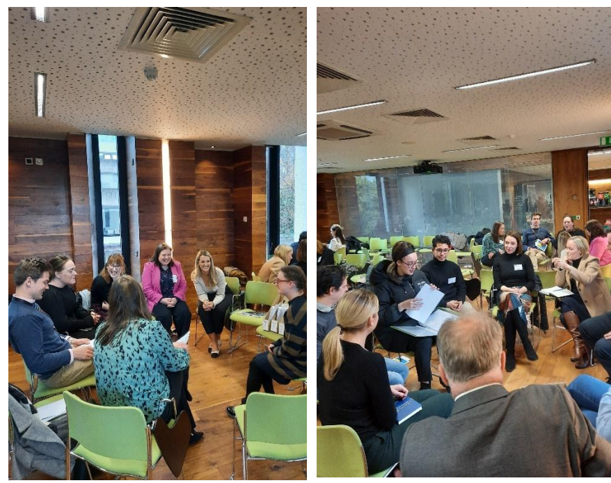
TCPID Business Partners working in groups with students

We had a fantastic discussion for the last hour of the meeting to reflect on the task and to explore ways for us to improve support for our students and graduates within the workplace.