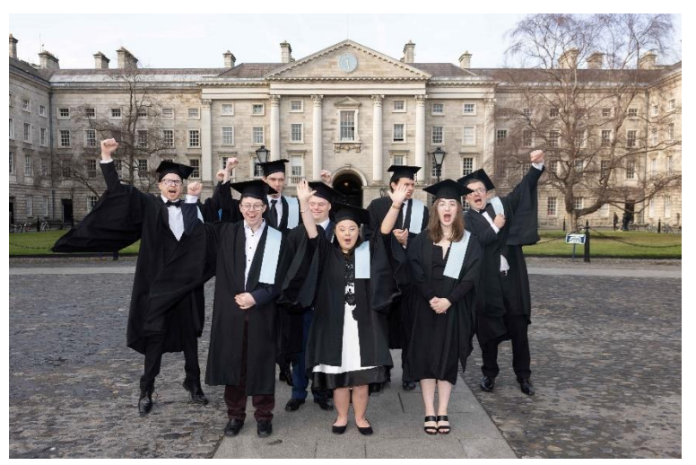
Graduates jumping with joy in Front Square