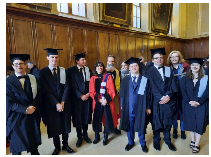
Graduates with TCPID and School of Education staff in the Dining Hall