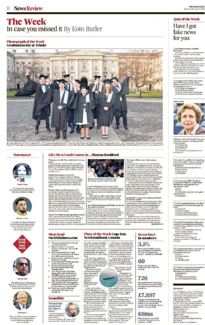
The Irish Times Photo of the Week Saturday February 3rd 2024