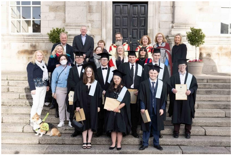
TCPID staff with the new graduates on the Dining Hall steps