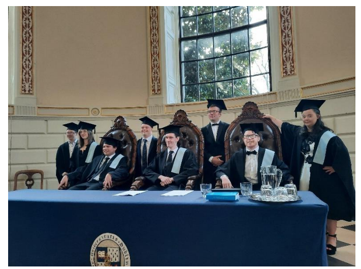
Graduates posing at the top of the Exam Hall

We were thrilled to see one of the photos from the graduation appear in The Irish Times on Saturday February 3rd as Photo of the Week!