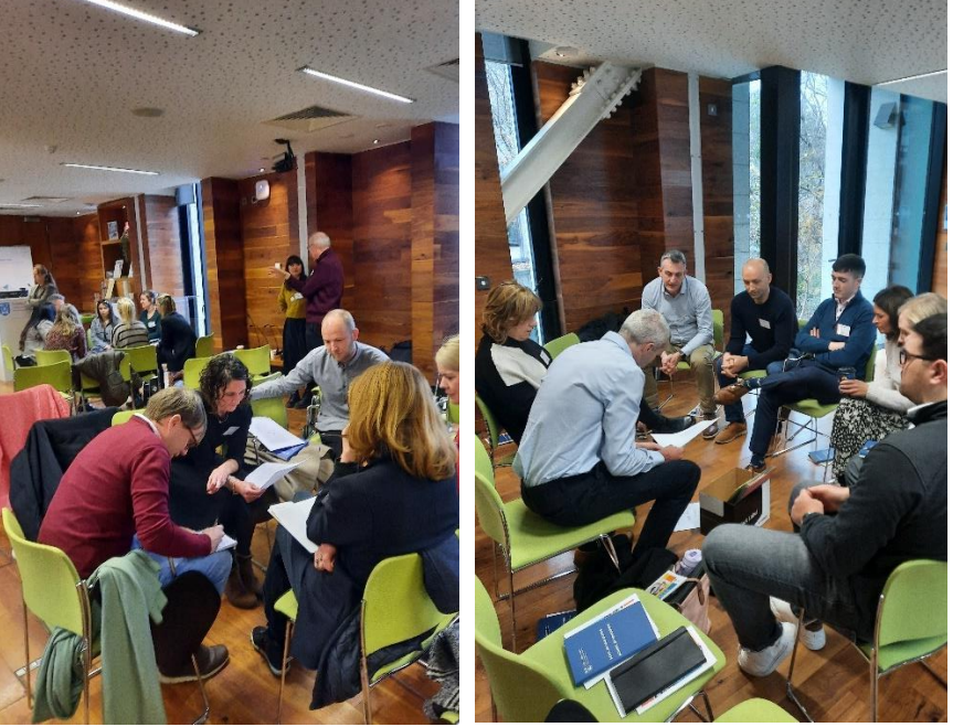
TCPID Business Partners working in groups with students