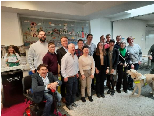
Group photo with TCPID students, lecturers and invited guests

In their presentation, the students highlighted barriers and enablers in education and employment for people with intellectual disabilities. They demonstrated the value of their learning in the Certificate in Arts, Science and Inclusive Applied Practice course and discussed their work experiences with the TCPID business partners.