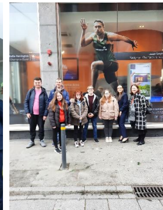
Permanent TSB class visit