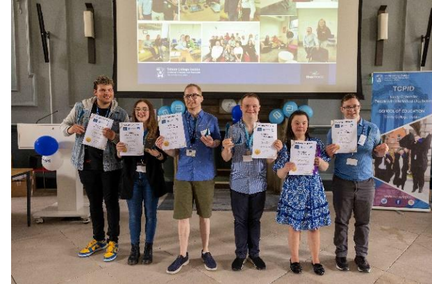
Some of our participating students with their SciFest certificates