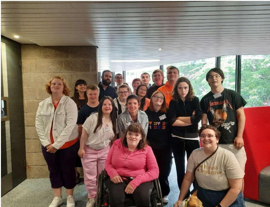
Participants of the TCPID Summer School 2024

The TCPID Summer School offered a diverse range of workshops that sparked the curiosity and creativity of the participants. From poetry writing to health and fitness, the students had the opportunity to explore different subjects and engage in hands-on activities.