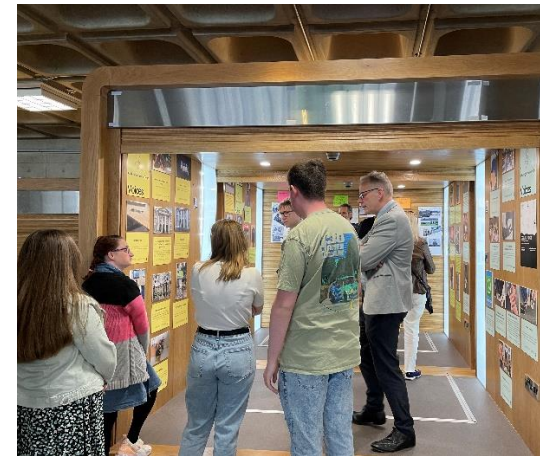
1 st year students presenting their Photovoice exhibition to invited guests