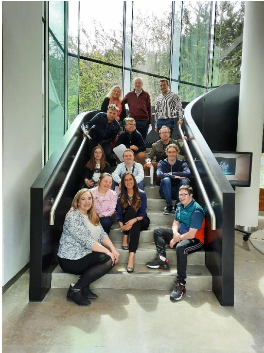
Smurfit Kappa workshop