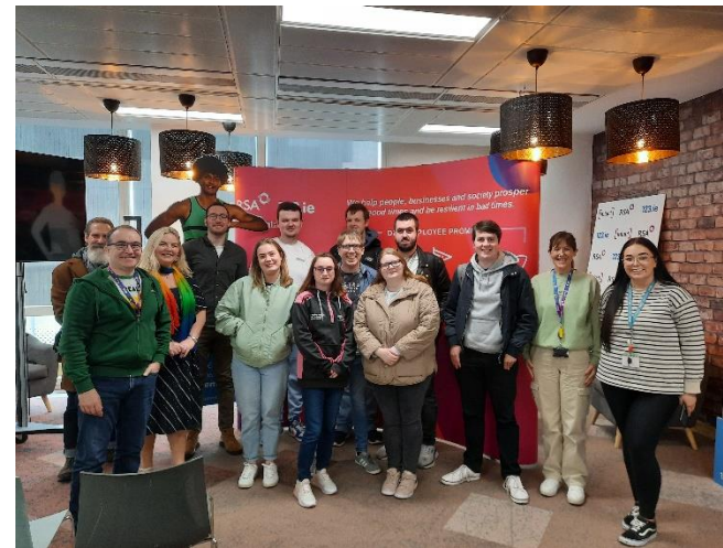
RSA Insurance and 123.ie workshop

“Thank you for the great time in RSA Insurance and for the treats on the last day and the goodie bags full of nice stuff.”