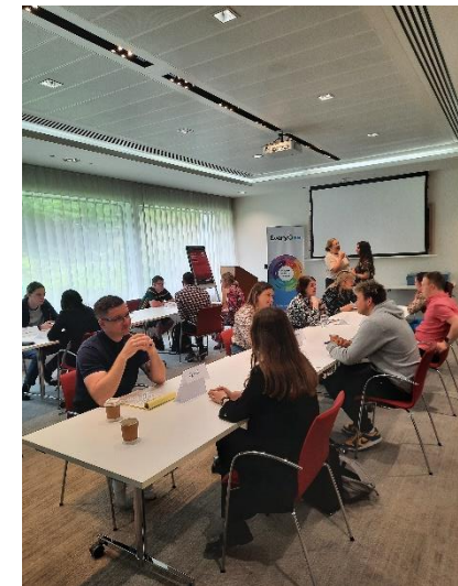
Smurfit Kappa workshop