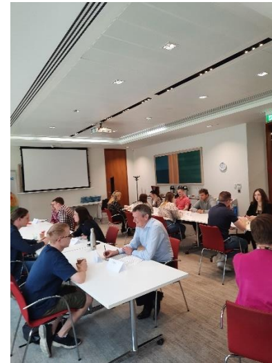
Smurfit Kappa workshop