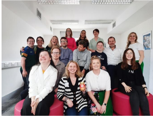
Abbott SciFest workshop