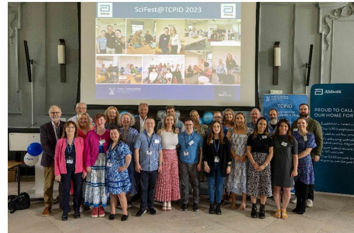
TCPID students with the TCPID, Abbott and SciFest teams

This is the seventh year of the Abbott Ireland TCPID partnership. We have developed such an incredibly strong partnership thanks to the incredible ongoing support of our Abbott colleagues for this programme every year. A huge thank you to all the wonderful Abbott team who supported the students with their projects throughout the month of May.