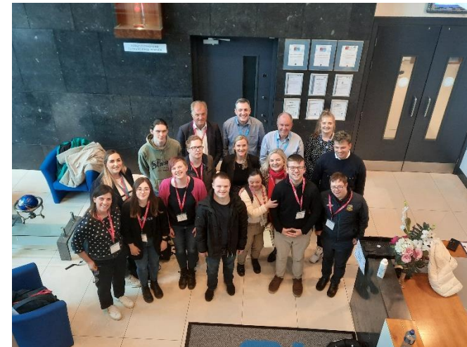
TCPID students with the Abbott team in Longford

“Thank you very much for a great day visiting Abbott in Longford last Thursday. I found the tour of the laboratory very interesting and also the amount of pharmaceuticals produced. I think it is really important what Abbott do by providing high quality, safe and effective diagnostic products. Thank you also for the lovely goody bag.”