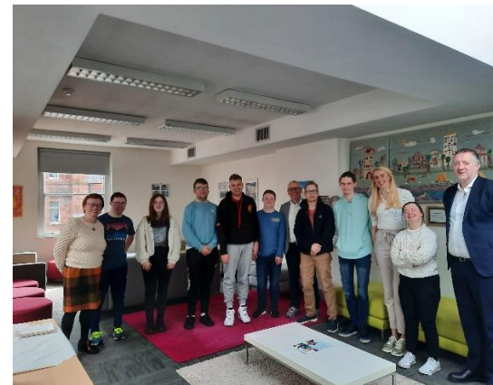
Dynamic guest lecture