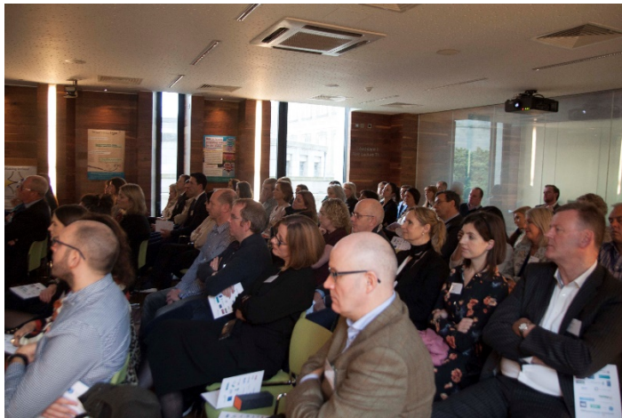
TCPID Business Partners meeting

We were delighted with a huge turnout of our existing partners as well as companies who are considering signing up with us.