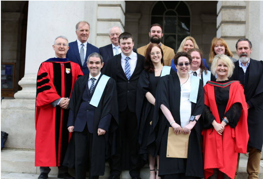
Some of our new graduates with the TCPID and School of Education team

Friday January 31 st 2020 was a very proud day for all of us in the TCPID as it was graduation day for our Level 5 Certificate in Arts, Science and Inclusive Applied Practice. Our new graduates celebrated their fantastic achievements with their proud families. It was a very happy day for everyone involved, particularly for the TCPID and School of Education teams.