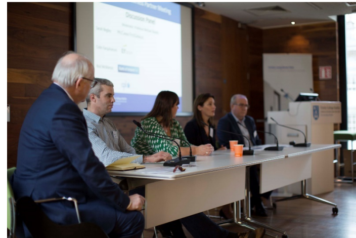
Panel discussion at TCPID Business Partners meeting