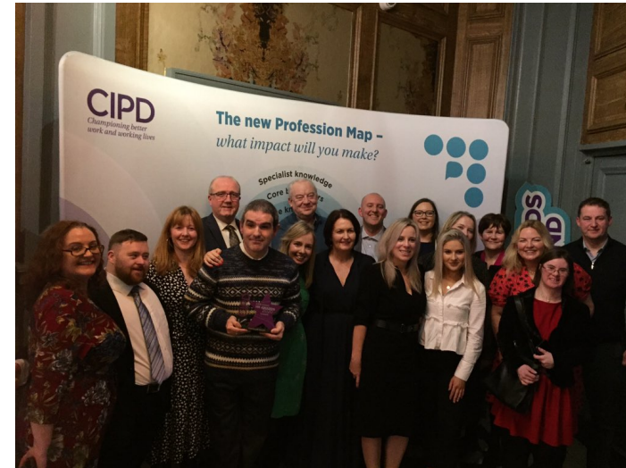
The winning team – EY and TCPID

EY have seen beyond the disability and have always focused on the ‘ability’ of each individual. They are helping to lead the way in changing the perception of intellectual disability, both in the corporate world and in society in general.