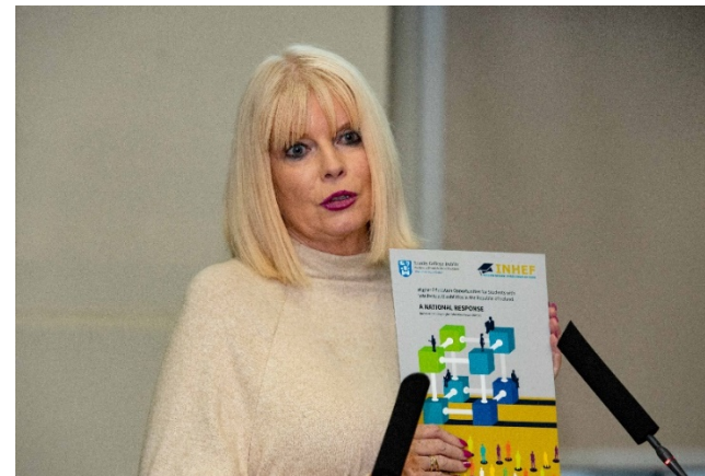
Minister Mary Mitchell O'Connor with the INHEF report

The vision of INHEF is to embed inclusive education initiatives and alternative access routes into the higher education landscape in the Republic of Ireland so that students with intellectual disabilities have meaningful post-secondary educational opportunities available to them. The INHEF are calling for partners in Government, higher and further education, and the employers' community to help to achieve their goals.