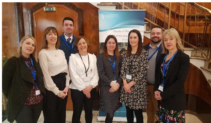
Presenters at THE Conf, Trinity College, March, 2020.