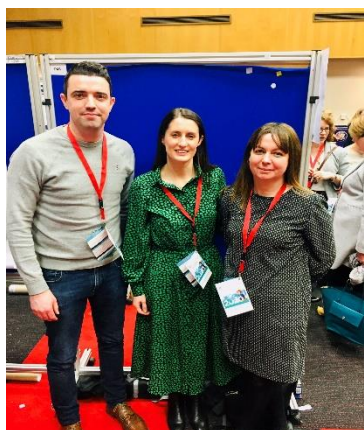
Presenters pictured at RCSI Conference, Feb 2020.