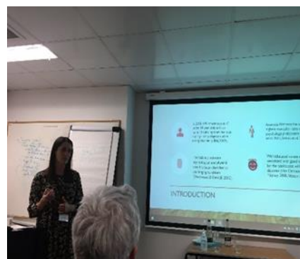
Staff pictured presenting at Trinity Health and Education Conference March 2020.