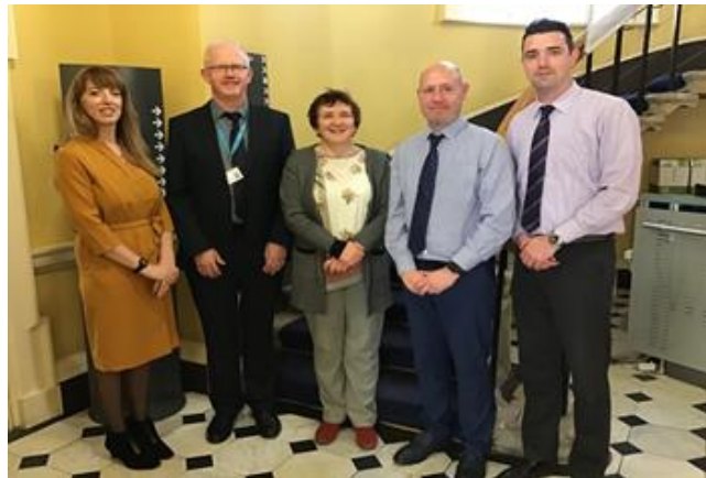
Inaugural Steering Meeting with TCPHI and SPMHS Staff

Research group meetings and meetings with nurses to identify research questions take place on an ongoing basis. TCD Research staff attend ANP forums annually as well as CNS, CPC and CF meetings annually.