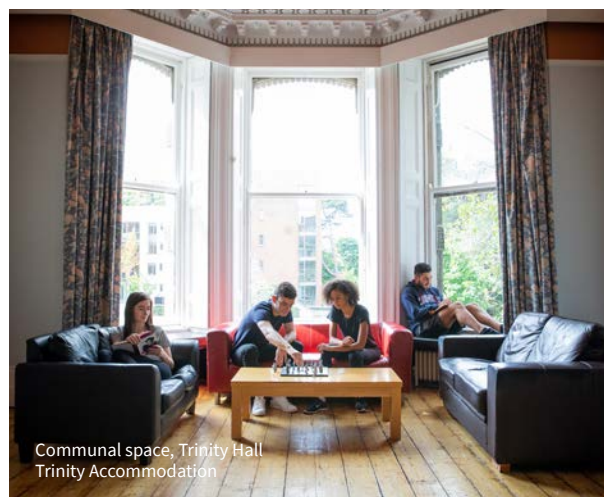
Communal space, Trinity Hall Trinity Accommodation

Applications for all Trinity accommodation are made online. In order to apply, you must have your Trinity ID number. After you have officially accepted your place, your application number becomes your student number. If you would like Trinity accommodation, you are advised to apply as early as possible: www.tcd.ie/accommodation