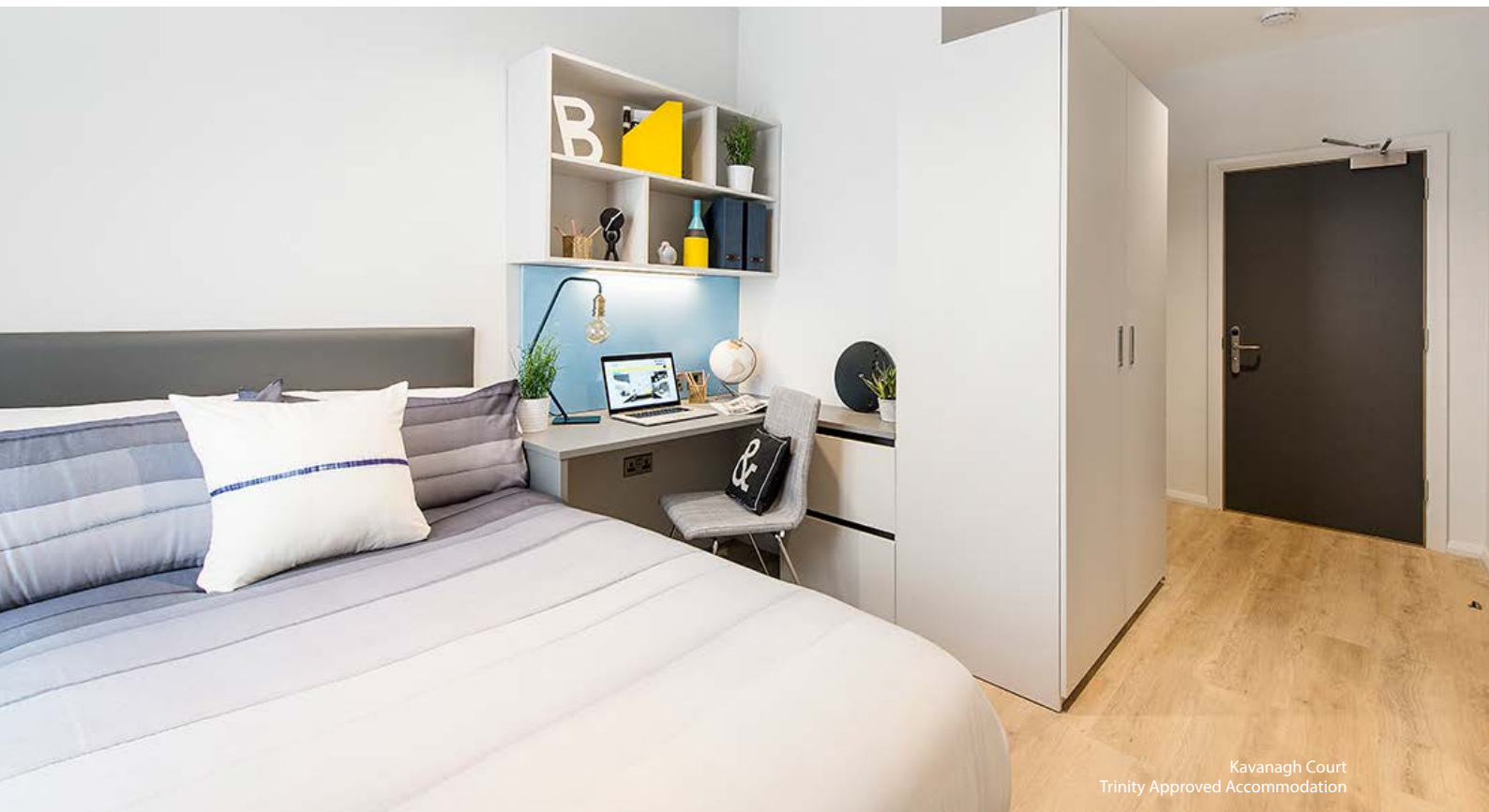
Kavanagh Court Trinity Approved Accommodation