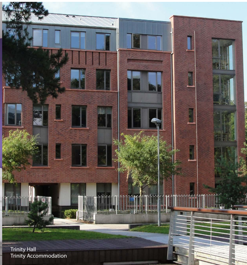
Trinity Hall Trinity Accommodation