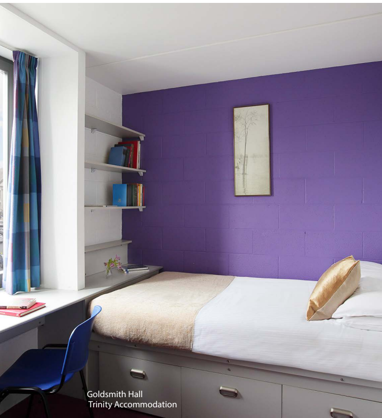
Goldsmith Hall Trinity Accommodation