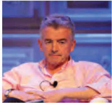
Michael O'Leary CEO, Ryanair