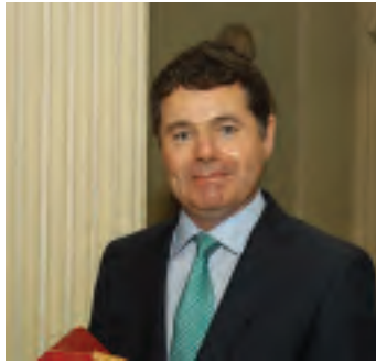
Paschal Donohoe, TD Minister for Finance, Public Expenditure & Reform

Many former BESS students are now leading figures in the fields of business, entrepreneurship, government and public service: