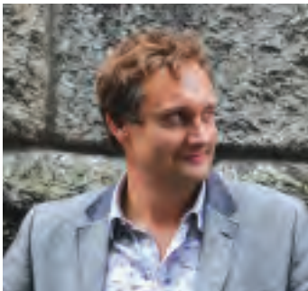
Mario Rosenstock Actor and Comedian