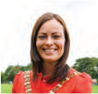
Nichola Mallon SDLP Deputy Leader