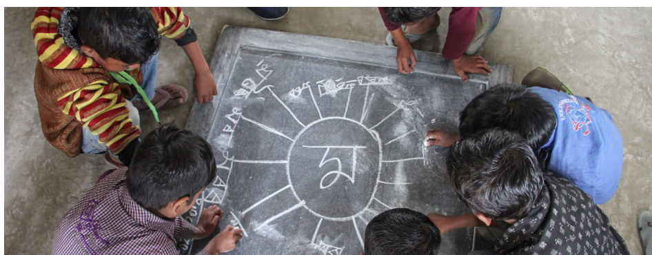
TIME study aims to improve learning outcomes for Indian primary school children

The Trinity Impact Evaluation Unit (TIME), a research centre based in the Department of Economics, brings together economics researchers, development practitioners and policy makers in a collective effort to estimate the impact of development aid and investment. TIME has entered a partnership with Irish Aid/Department of Foreign Affairs (DFA) which