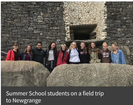
Summer School students on a field trip to Newgrange

Originally developed for students from Brown University, this year’s Summer School in Contemporary Global Politics has attracted students from two further prestigious universities, Harvard and Cornell, for the first time.