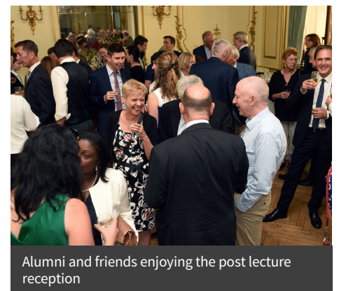
Alumni and friends enjoying the post lecture reception