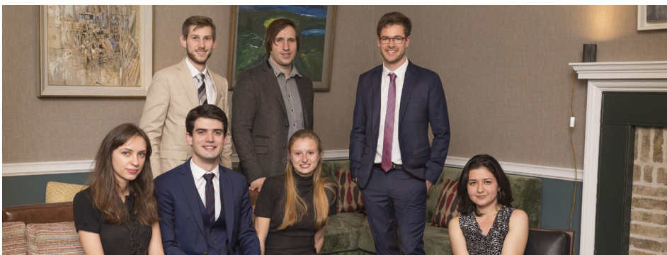
Grattan Scholars in the Trinity Alumni Room

At the core of The Grattan Scholars programme is the ambition to support and nurture exceptional students who have the potential to become future academic leaders. We are extremely heartened that, upon completion of their Ph.D. studies, a number of Scholars have chosen to further their burgeoning academic careers at