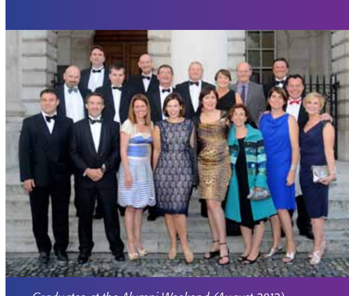
Graduates at the Alumni Weekend (August 2012)

Economic Forum and recent Trinity vs Oxford student debate that "This House Believes that Ireland Owes A Large Debt to Britain". If you are interested in getting involved in School activities please do get in touch.