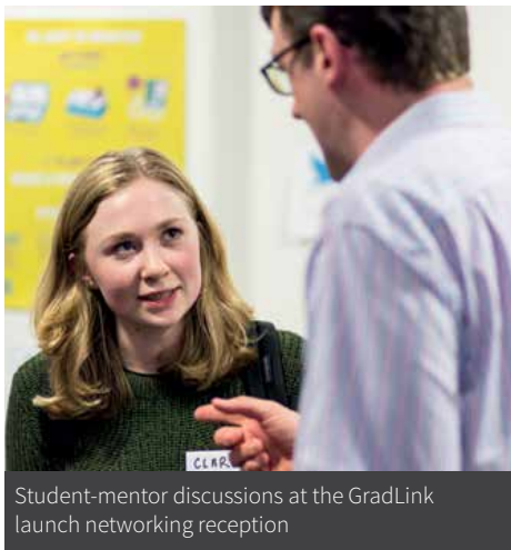
Student-mentor discussions at the GradLink launch networking reception

The 2016-2017 GradLink programme launch will take place on 27 October, 2016. If you are interested in getting involved as a mentor please visit www.tcd.ie/alumni/mentoring or email sspalum@tcd.ie