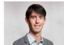
Image - landscape format cropped to 160 x 100 pixels (px) with appropriate usage rights

Professor Andrea Guariso Publishes in the Journal of East African Studies