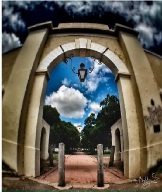
Curriculum in the context of transformation: Reframing traditional understanding and practices