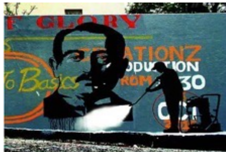
Evaluation of teaching and courses: Reframing traditional understandings and practices