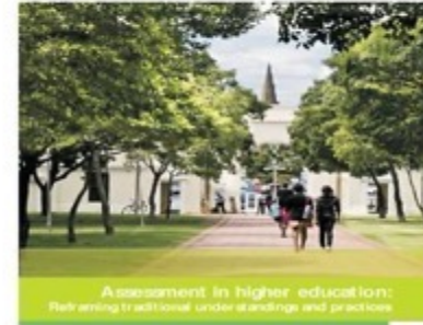
Assessment in higher education: Reframing traditional understandings and practices