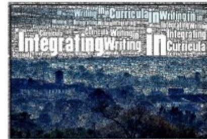
Integrating Writing Development in Curricula: Writing Intensive Project Case Studies