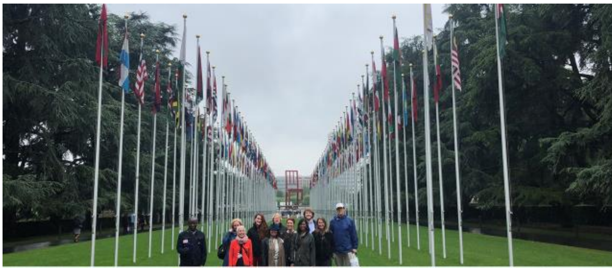
At the UN Gate