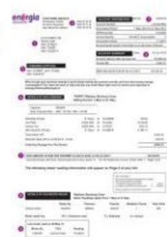
My Bill Summary for October 2015