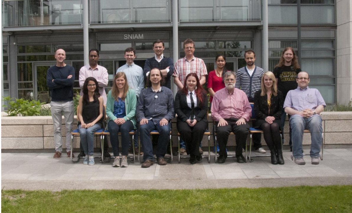
Magnetism and Spin Electronics Research Group, Trinity College, Dublin. Summer 2016