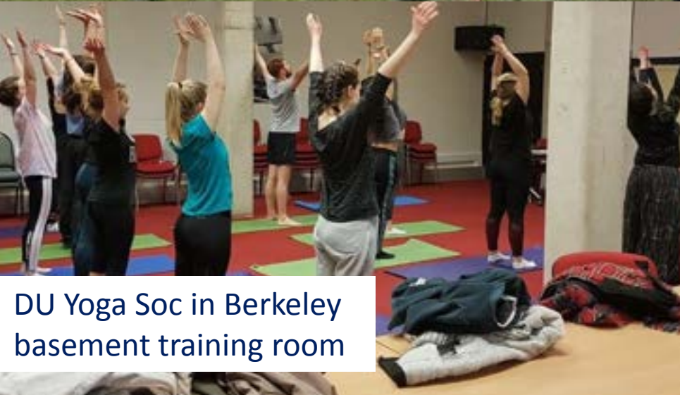
DU Yoga Soc in Berkeley basement training room