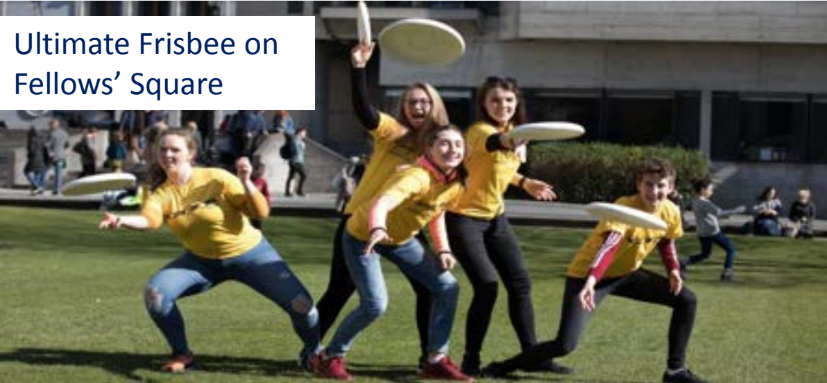
Ultimate Frisbee on Fellows' Square