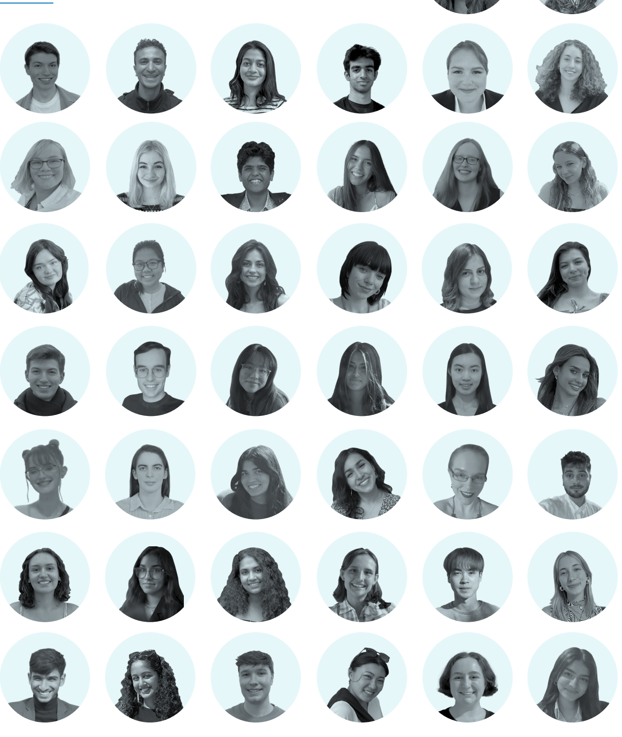
44 Global Ambassadors offer peer to peer support, campus tours and much more.