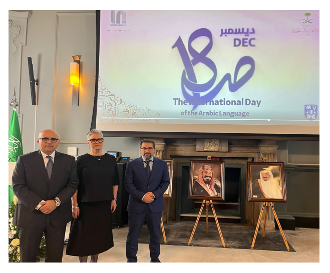
ABOVE: International day of Arabic Language.