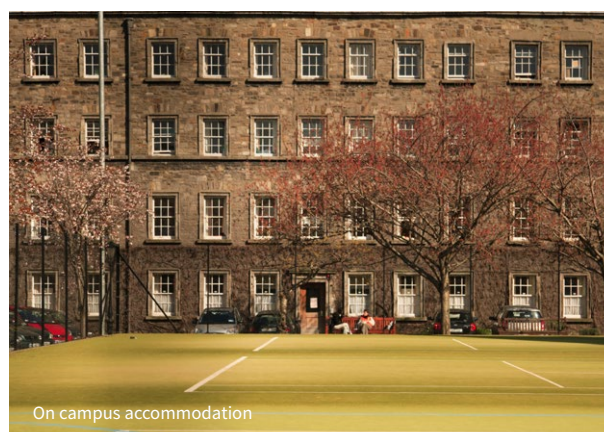
On campus accommodation