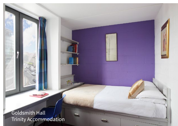
Goldsmith Hall Trinity Accommodation