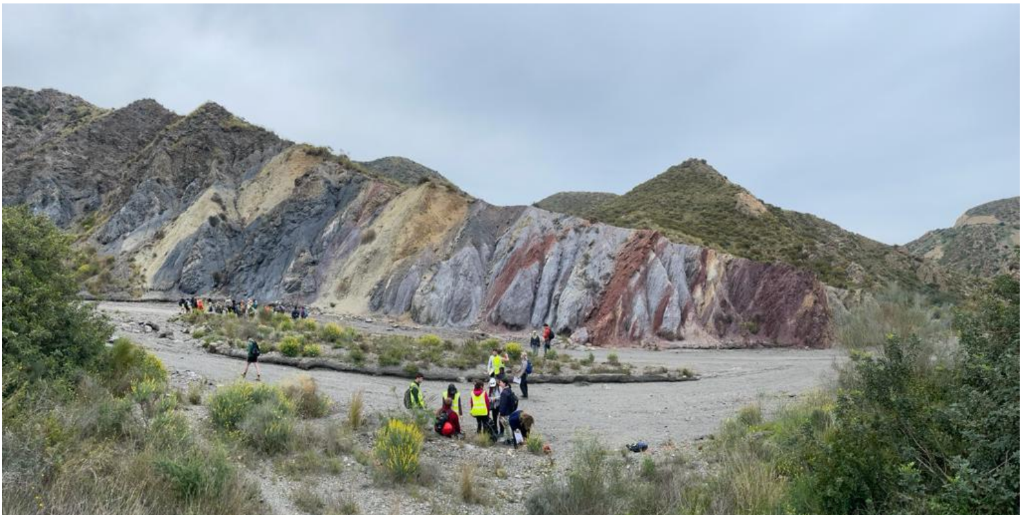
Image: Mapping exercise in the Carboneras Fault Zone.