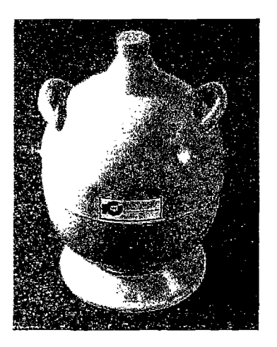
Figure 1 – Pouring Dewars