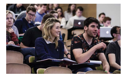
05 The Supervision Relationship Page 28