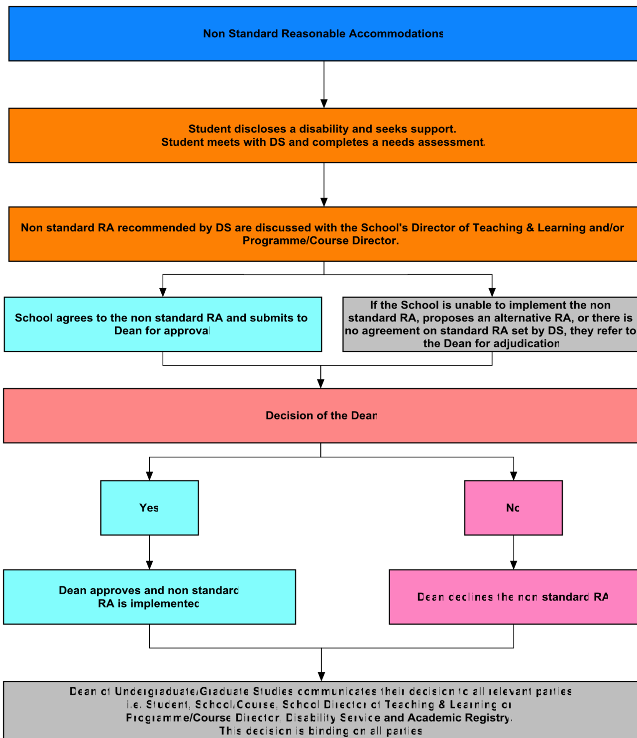
Diagram 2 - Non-standard Reasonable Accommodations approval process