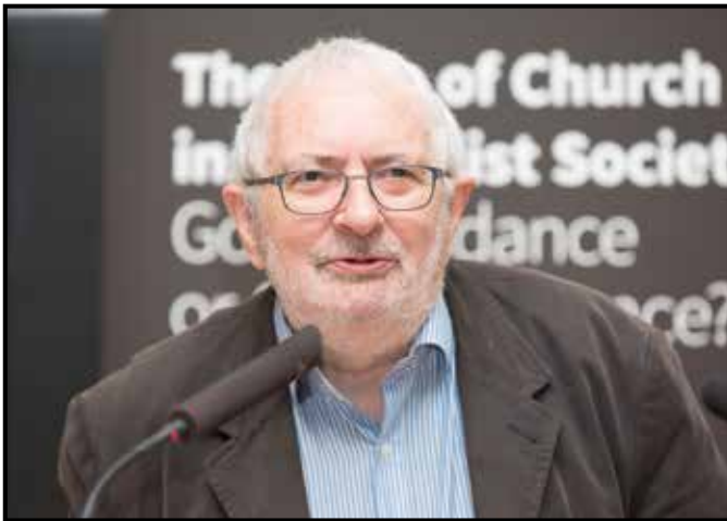
Professor Terry Eagleton delivering the opening paper to the conference