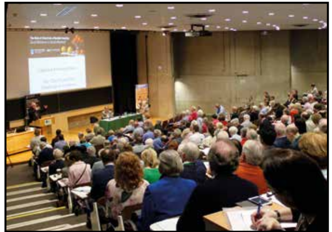
A packed audience at the conference