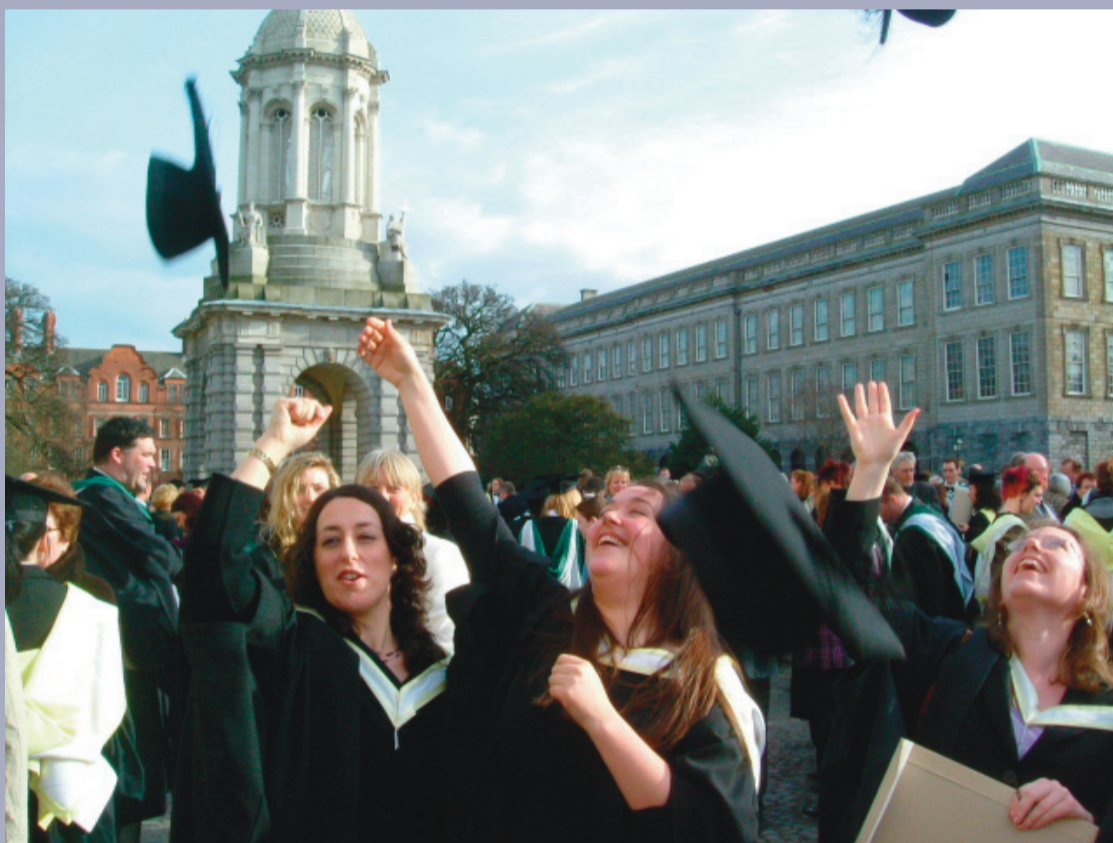
M. Phil in Literary Translation Class of 2006

Url: www.tcd.ie/langs-lits-cultures/postgraduate/literary_translation