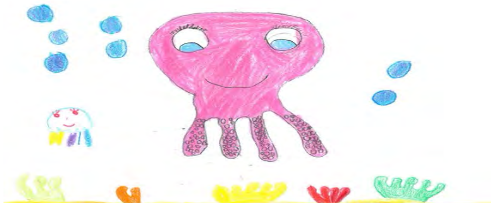
Children's perception of the marine environment (Ioannis Giovos)