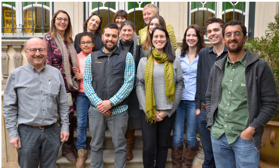
WG2 meeting Orkney 2 nd April 2016