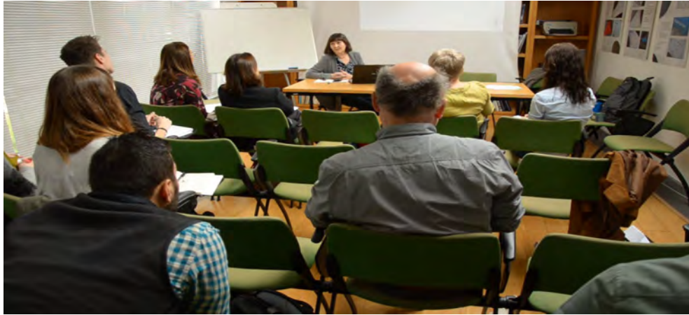
WG2+WG4 Madeira workshop