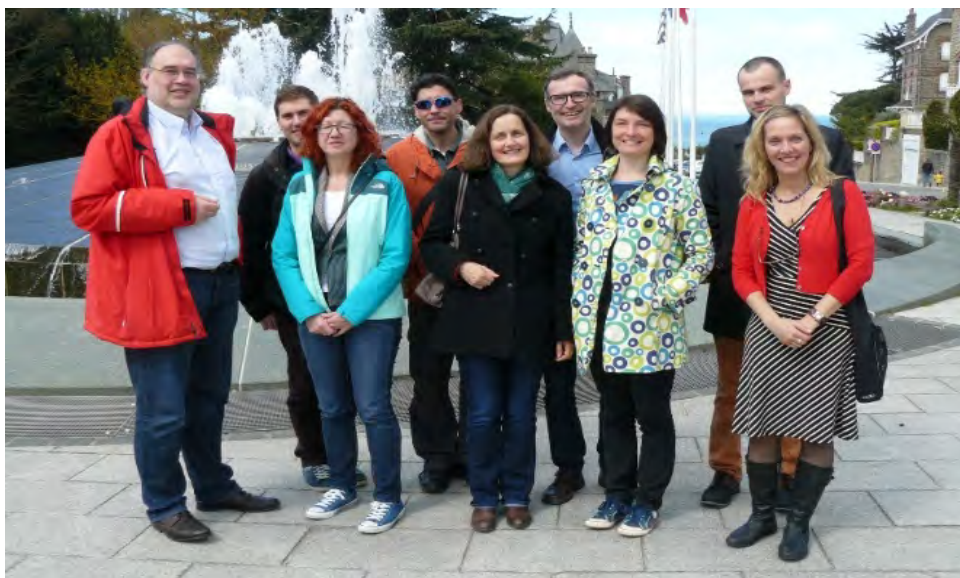
WG3 meeting WGSEDA Brest France 12 th April 2016