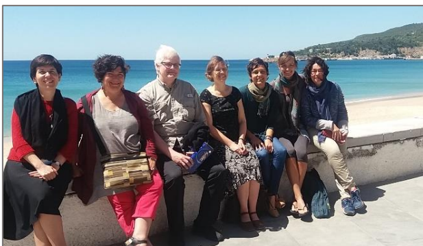
Oceans Past attendees enjoy beautiful Sesimbra.