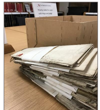
Prize Papers, Kew National Archives in London

Prize papers a novel source of social, cultural, and economic insight. In maritime law, a prize is an enemy ship captured in war. Crews who participated in a prize ship’s capture collected a share of the value of its sale or of its cargo, provided it could be demonstrated to be an enemy ship and not the ship of a neutral power. The archival materials that resulted are known as the ‘Prize Papers’, which consist of Court Papers, produced at the trial (interviews of the master and crew, lading bills etc.), and Ship’s Papers, those seized at the ship’s capture, but not used in court as evidence material. The ships were comparable to floating post-offices, and therefore documents carried on board yield unique material for socio-cultural, economic and even language (dialects, vocabulary, grammar, etc.) studies of the period from the 17th to the early 19th century. The