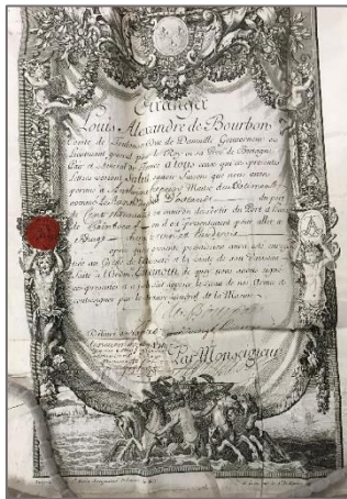
Example of the Prize Papers

Prize papers a novel source of social, cultural, and economic insight. In maritime law, a prize is an enemy ship captured in war. Crews who participated in a prize ship’s capture collected a share of the value of its sale or of its cargo, provided it could be demonstrated to be an enemy ship and not the ship of a neutral power. The archival materials that resulted are known as the ‘Prize Papers’, which consist of Court Papers, produced at the trial (interviews of the master and crew, lading bills etc.), and Ship’s Papers, those seized at the ship’s capture, but not used in court as evidence material. The ships were comparable to floating post-offices, and therefore documents carried on board yield unique material for socio-cultural, economic and even language (dialects, vocabulary, grammar, etc.) studies of the period from the 17th to the early 19th century. The