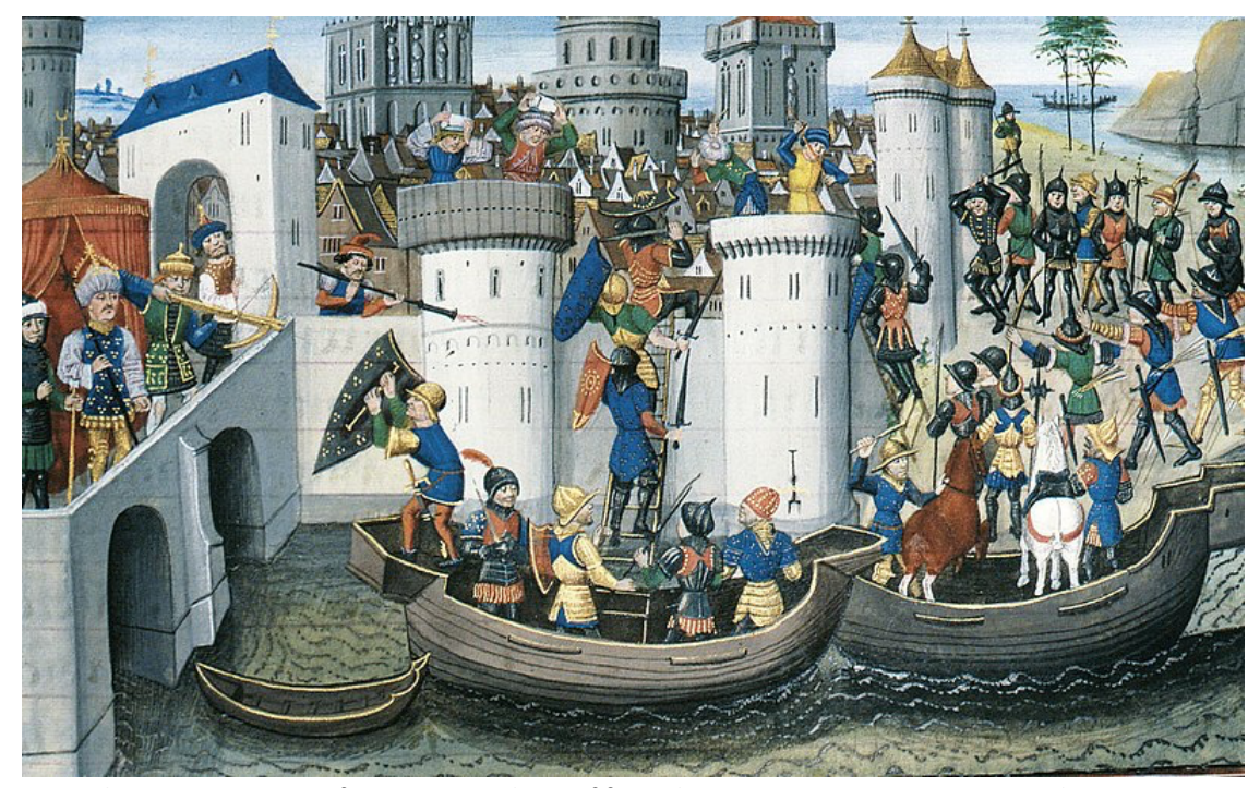
The 1204 conquest of Constantinople in a fifteenth-century miniature, BnF Arsenal MS 5090

In August 1096, something new happened: armed groups of Christians set off from Western Europe with the aim of 'liberating' Jerusalem from Muslim rule. The Christian capture of Jerusalem in 1099 marked the end of the First Crusade, the establishment of the Crusader States, the beginning of nearly two hundred years of Christian occupation of the Holy Land. Over the following centuries, the idea of crusading and the existence of the crusader states would change the political landscape of both Europe, the Levant, and North Africa. Kings, emperors, and popes struggled to work out what crusading meant for their own authority; new religious orders were founded to support the crusading enterprise; and undertaking a crusade became an increasingly important part of noble identity. Nor was crusading limited to the Holy Land, as military actions were launched in Iberia, Egypt, and the Baltic States. Crusading could even be turned against one's fellow Christians, as they were in the Fourth Crusade and the Albigensian Crusade.