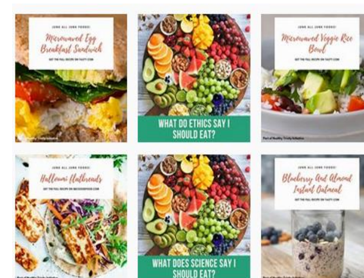
A Healthy Eating campaign run in January on Instagram. Campaigns for different health behaviours throughout the year will be run e.g. stress at exam time, drugs before Trinity Ball