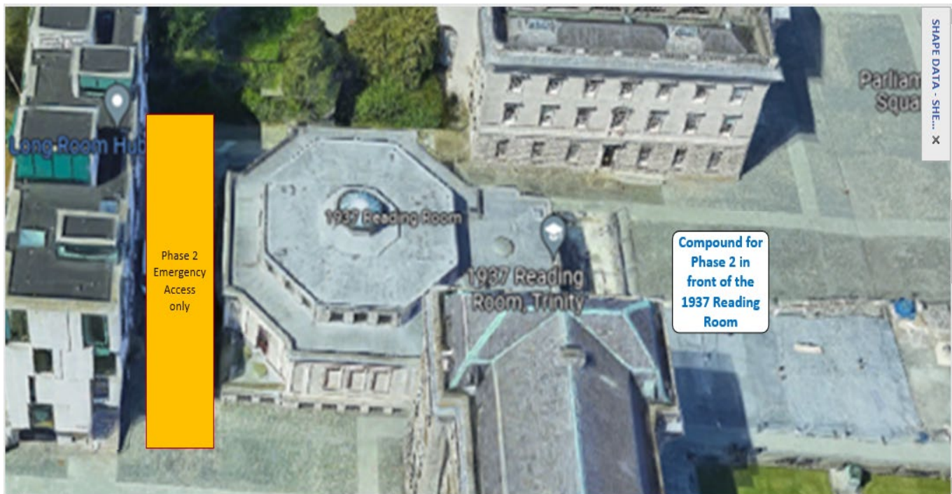
Phase 2 – Restricted Access to complete the maintenance works at the Long Room Hub (November 2022)