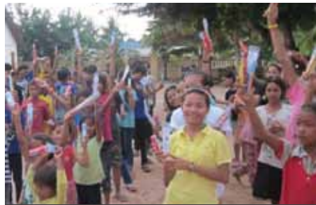
Children in a Cambodian orphanage receiving their oral-hygiene packs (toothbrush and toothpaste)

DOVE 2013 travelled to resource-poor communities where they assessed and treated a wide base of patient groupings, from children in a Cambodian orphanage, to Honduran schoolchildren, to adults in a Brazilian primary-care setting. The one common denominator they saw in the patient groups was the elevated levels of decay compared to that which is the norm at home. Poor access to care, inadequate dietary practices and lack of oral healthcare education were evident across the board.