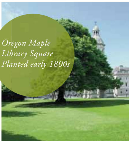
Oregon Maple Library Square Planted early 1800s

Connect with us on LinkedIn: Trinity College Dublin & Dublin Dental University Hospital