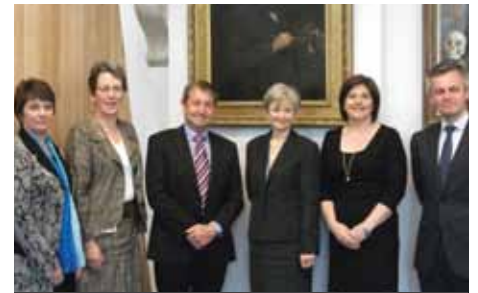
Australian Dental Council visit

The Trinity School of Dental Science and Dublin Dental University Hospital were delighted to welcome delegates from the Dental Board of Australia, the Dental Council of New Zealand and the Dental Council of Ireland to the School and Hospital in October 2013.