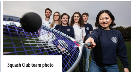
Squash Club team photo