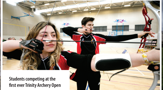
Students competing at the first ever Trinity Archery Open