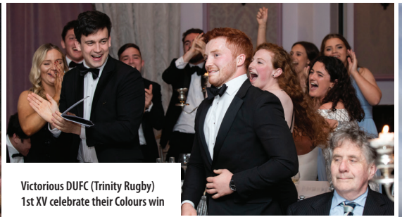
Victorious DUFC (Trinity Rugby) 1st XV celebrate their Colours win