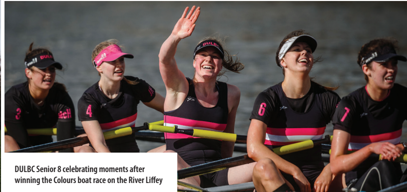
DULBC Senior 8 celebrating moments after winning the Colours boat race on the River Liffey

For a while, ladies' hockey (DULHC) looked like they might be heading back up to the top-flight women's EY league. However, the play-offs didn't go their way and their consolation had to be finishing the season as Leinster Division 1 winners.