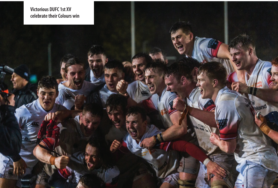
Victorious DUFC 1st XV celebrate their Colours win