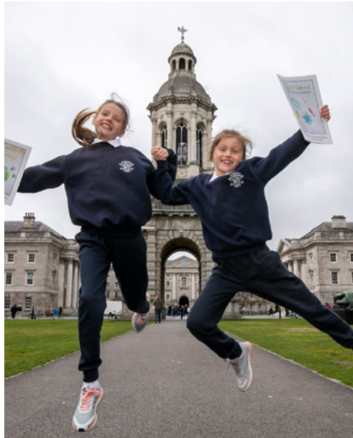
Above: School children from St Patrick's Loreto Primary School, Bray, present their booklets containing their memories, reflections and artwork to the Library as part of the Living in Lockdown project

In April, the Library welcomed 60 school children from St Patrick's Loreto Primary School, Bray who had participated in the Living in Lockdown project. Ranging in ages from four to 12, these recorders of the pandemic presented high-quality booklets containing their memories, reflections, and artwork to the Library.