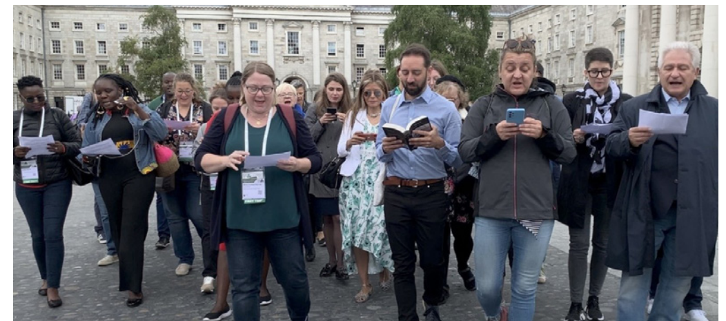
Above: Marking the centennial of the publication of Ulysses , a "librarians' flashmob" took place in Library Square, where participants read excerpts from Ulysses in their own languages. The event was organised by the World Library and Information Congress (IFLA-WLIC)

In addition to the in-person Keynote address at the IFLA World Congress in Dublin in July 2022 (see page 4), the Librarian delivered a presentation and discussion in the series of events staged by Bibliotheken der Universität Zürich (UZH) and Zentralbibliothek Zürich (ZB) celebrating the founding of the new University Library under the theme; Virtual Books, Data, Rooms. The University Library in the 21st Century: The role of libraries in the dialogue between academia and society .