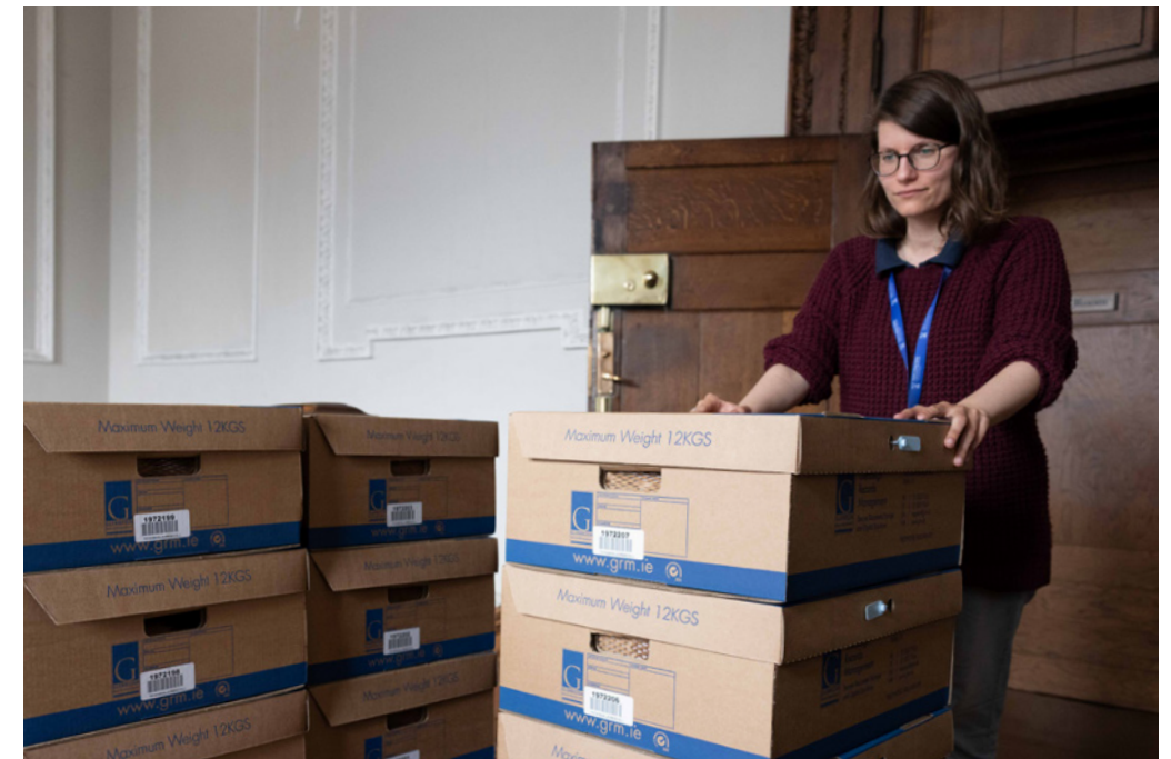
Above: Boxing-up decanted Old Library books for transfer to offsite storage

An interim onsite warehouse management facility has been operational since the start of the decant, so readers can continue to consult Old Library materials. It provides a useful test space for the scaled-up version, which will be launched in 2023 as the decant winds down and renovation works begin.