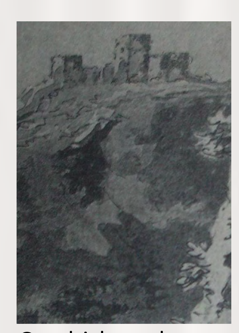
Goodrich castle Warwick castle

The genesis and development of Charleville castle