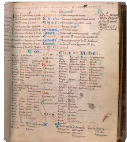
John of Worcester, Chronicle, Trinity College Dublin MS 502 f. 10r.