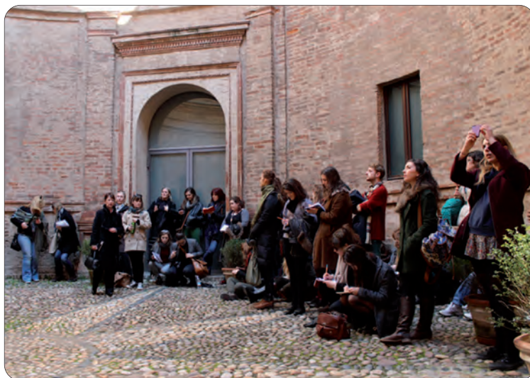
House of Andrea Mantegna, Mantua, 2013.