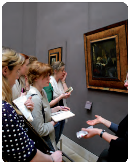
The Louvre, 2012.