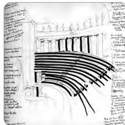
Student sketch, Teatro Olimpico, Vicenza.