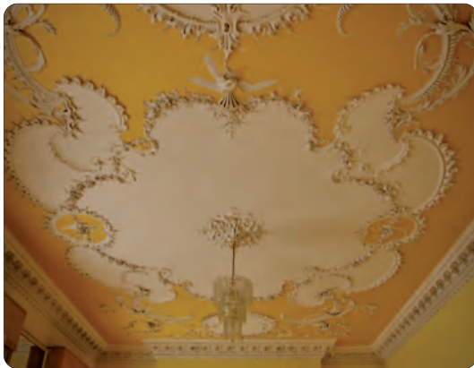
Number 26 Merrion Square.