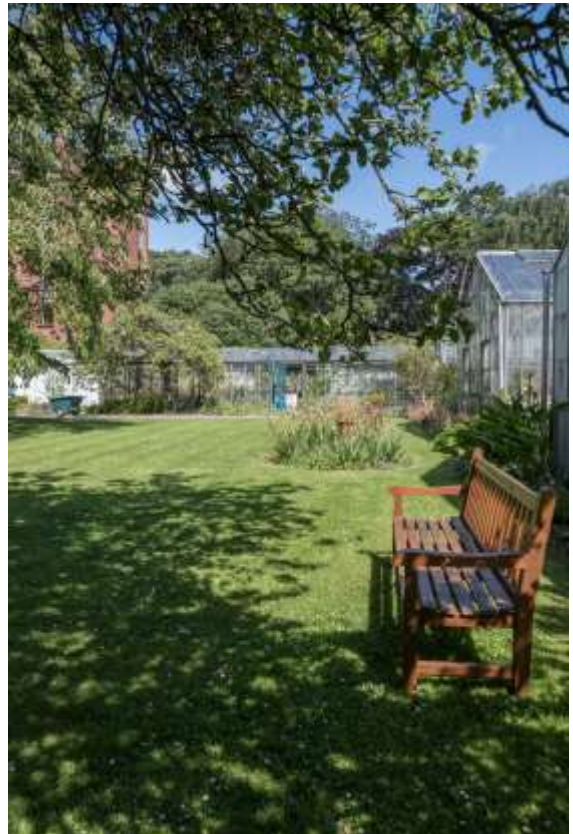
Lawn area in walled garden

Trinity College Botanic Garden bounds the Trinity Hall campus to the north and east. It is the only dedicated university botanic garden in Ireland and has been an important teaching and research facility of the Botany Department for over 300 years. It has moved location three times and in 1967 was relocated to its present Dartry site. The garden includes three main areas: the Walled Garden with glasshouses and staff facilities; the West Arboretum along the Palmerston Park boundary and the South Arboretum behind the Trinity Hall Sports Hall. Together they contain around 4000 plant species.