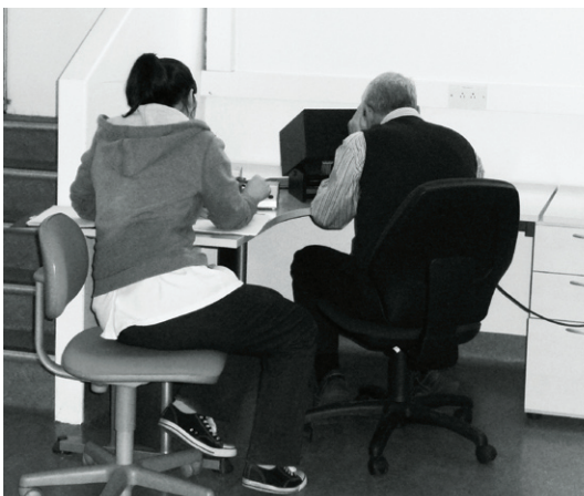
A participant of the Health Assessment during a test for Age Related Macular Degeneration.

In the first TILDA pilot, respondents completed a face-to-face interview and self completion questionnaire in their home, and were then invited to attend a dedicated centre in Trinity College Dublin for a health assessment. The assessments were scheduled at a date and time which suited the respondent, and were carried out by highly trained nurses. Transport was provided to and from the centre for those who wished to avail of it and the assessments took an average of 2½ hours each. Of the 143 social interviews conducted in the pilot, 89 participants volunteered for the health assessment. Each of the participants received a copy of their test results and those that had given blood received the results within a few days of taking part. 100% of respondents who participated rated the assessment as good or better. Overall the experience was very positive and the friendliness, organisation and approachability of the Health Assessment Centre team was absolutely key to its success.