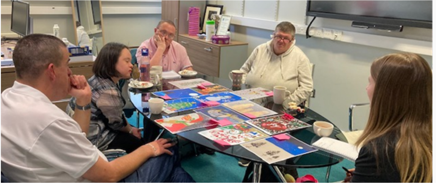
Our PPI panel judging the Christmas card entries.

Our panel of PPI contributors had a difficult job choosing just three artworks from the wonderful pieces received.