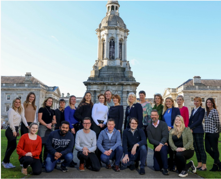
Left: Visitors from Erasmus MC, Netherlands with the TCAID team.

In November, TCAID hosted a team from the Healthy Ageing and Intellectual Disability (HA-ID) study at Erasmus MC in the Netherlands. The aim of the visit was to share longitudinal research study findings and identify future opportunities for collaboration. A Memorandum of Understanding was signed with Erasmus MC.