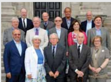
Class of 1973

Are you thinking about organising a get together of alumni from your time in College? Then drop us an email at alumni@tcd.ie as we would love to hear from you. And remember, this August graduates from the classes of 2004, 1994, 1984, 1974 and 1964 (and before!) and will be descending on campus to meet up with old friends and celebrate their anniversary years.