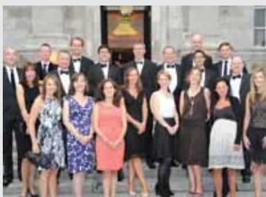
Class of 1993