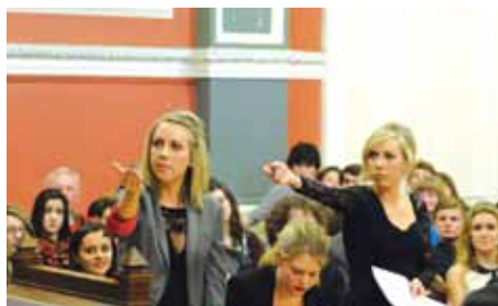
February 2013 Student Economic Review debate

Find out more on the recently revamped SER website www.tcd.ie/Economics/SER/index.php which includes details regarding sponsors, reflections from past SER Committee Members and copies of previous SER publications from over the last 27 years.