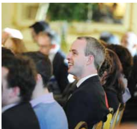
Alumni and friends enjoying the lecture

Over 100 guests including alumni and friends, representatives of London-based think-tanks, EU institutions and embassies attended the first talk in the Henry Grattan Lecture Series to be held outside the Trinity campus.