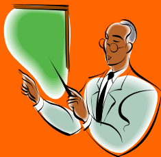
Rud & Ann Turnbull

You will learn about supporting people with disabilities to move from school to adult lives.