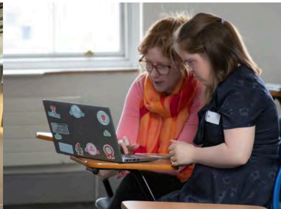
The concept of inclusive research epitomises the transformation away from research on student to research with students