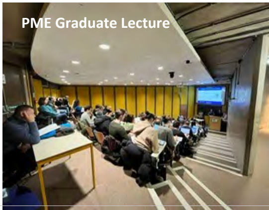
Educating future teachers on how to be inclusive in the classroom. Our graduates lecture the Professional Masters in Education Students.