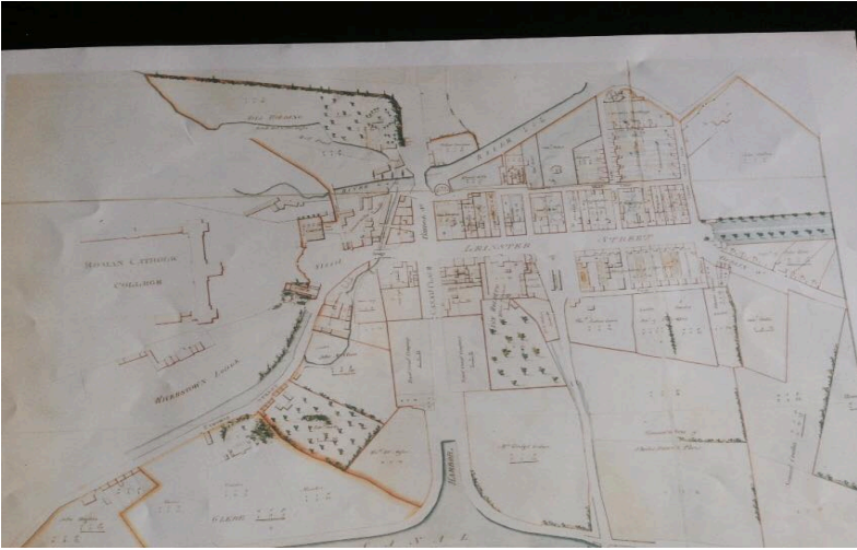
Map 1: Showing Maynooth in 1821 (Irish Historical Town Atlas, No.7 Maynooth, 1995)