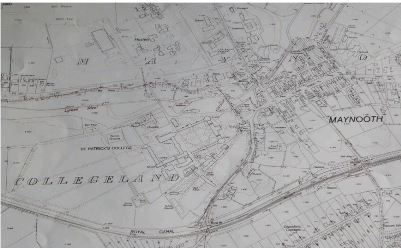
Map 2: Showing Maynooth in 1940 and its Growth to North and South West (Irish Historical Town Atlas, No.7 Maynooth, 1995).