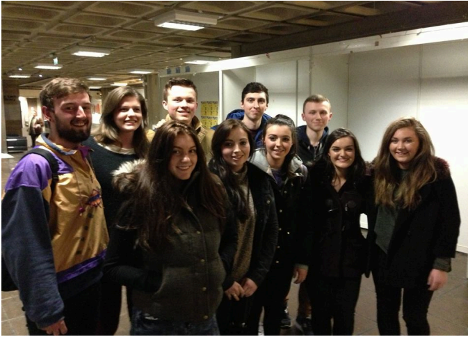
DU Geographical Society Committee members 2015/16