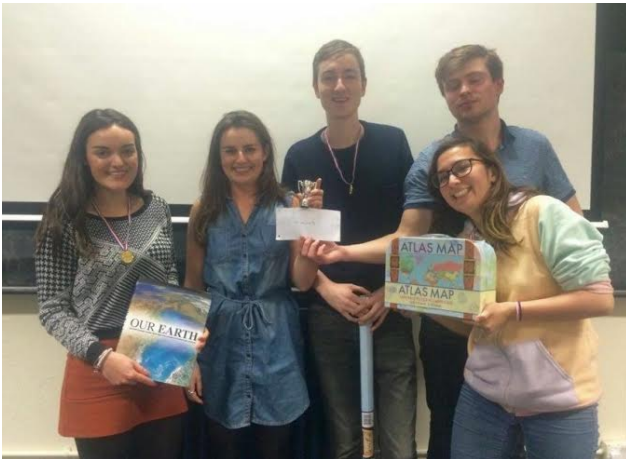
Geolympics Winners 2016!!!