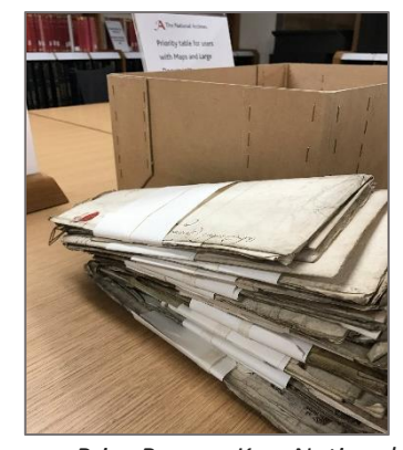
Prize Papers, Kew National Archives in London

documents are predominantly French, Spanish and Dutch. The Prize papers were screened for relevant material to document the history of Flanders, in particular during the Spanish Succession War. Material obtained from the Prize Papers will shed new light on the maritime history of Flanders (including fisheries) and provide elements in microhistory that were in so far unexplored or insufficiently known. This preliminary research was possible thanks to support by Oceans Past Network (COST STSM-IS1403-37510) and the collaboration between the Flanders Marine Institute VLIZ and Museum aan de Stroom (MAS-Antwerp).