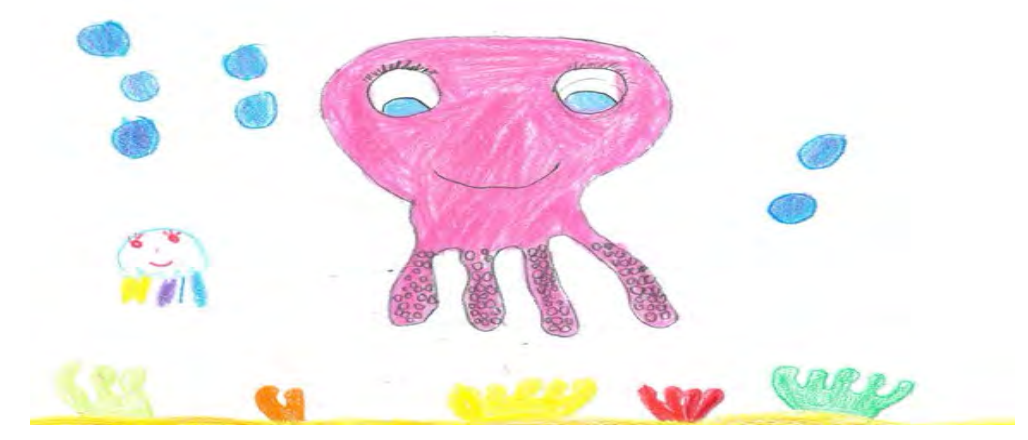
Children's perception of the marine environment (Ioannis Giovos) STSM