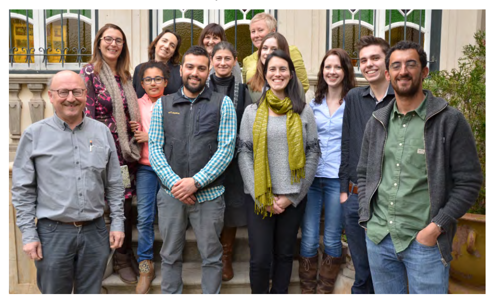
WG2 meeting Orkney 2<sup>nd</sup> April 2016