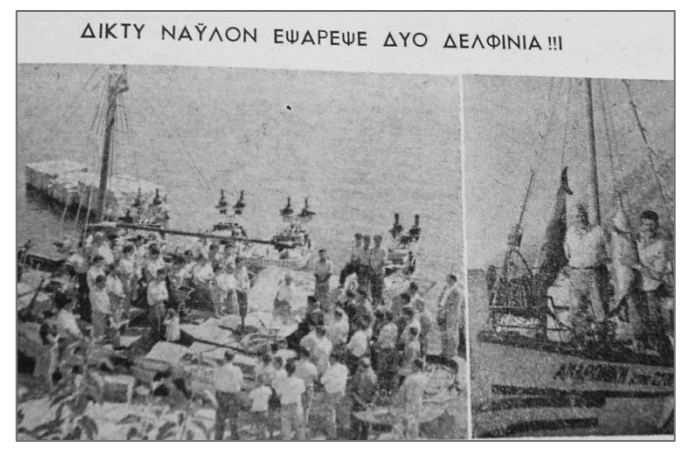
Nets captured two dolphins in Astakos port, Western Greece.

abundances and level of interaction with the professional fishermen would be conducted through grey literature (i.e. fishing magazines, newspapers, and unpublished technical notes). The period of the study will cover the early Greek fisheries (1925) till the end of the 20th century. The type of the data to be searched will be related with: (a) subsidies on dolphin culling, (b) areas of dolphin peaks and interactions, (c) the views of the professional fishermen and of the society about culling dolphins, (d) season of dolphin interactions, and (e) management issues. The researchers are happy to discuss and collaborate with scientists from other countries conducting similar research in order to share ideas and forward collaboration. For more contact: Dimitrios K Moutopoulos at dmoutopo@teimes.gr.