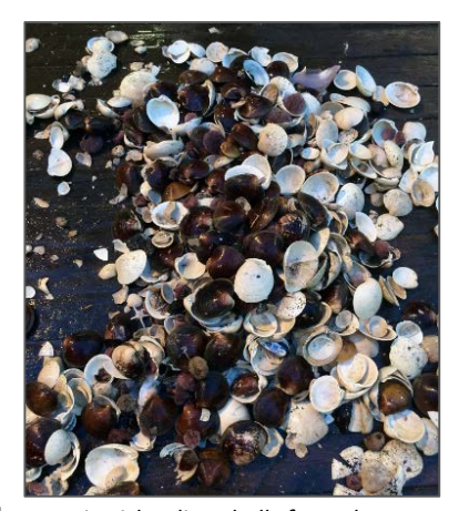
Arctica islandica shells from the Faroe shelf.

MULTICHRON ("Constraining modeled multidecadal climate variability in the Atlantic using proxies derived from marine bivalve shells and coralline algae") will build on previous and ongoing research to develop a data set of annually-resolved records, and will use this data to develop reconstructions in conjunction with state-of-the-art climate