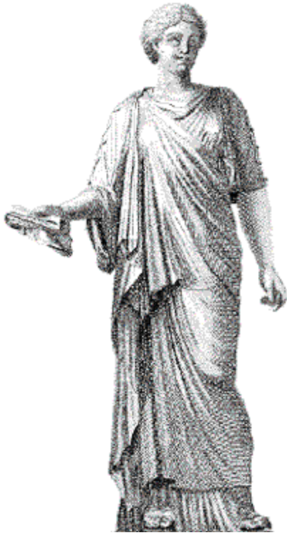
Clio: the Muse of History

This is a course that proposes to take an historical approach to the difficult but fascinating subject of Historiography. Its aim is to provide students with a survey of the principal movements and debates which have shaped historical research and writing over the past eighty years or so. Though the approach will be largely chronological, a principal aim of the course is to introduce students at once to the major theoretical and methodological problems which continue to confront historians in their everyday work, and to present them with the opportunity of examining some of the classic texts of modern historical writing.