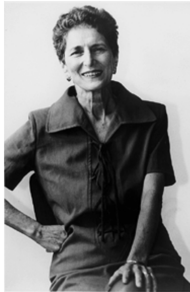
Natalie Zemon Davis