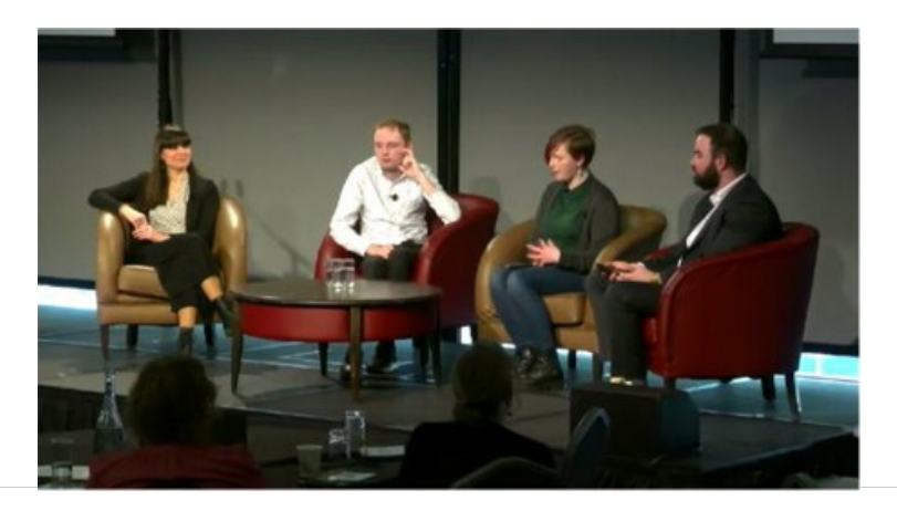
We disseminate our research and practices with the aim of creating the momentum for change in education to a more inclusive and equitable place for students with intellectual disabilities.