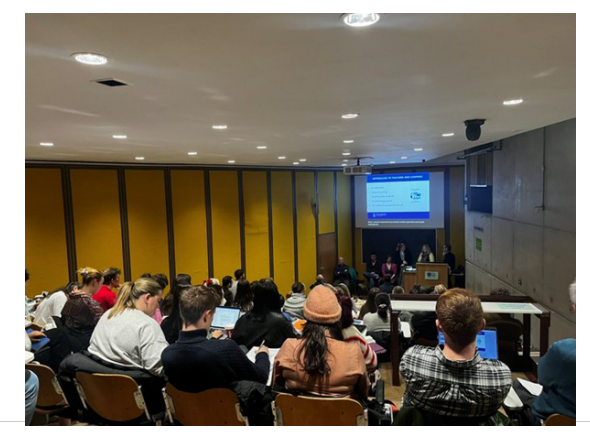
Another packed house for the ever popular annual Lecture by TCPID graduates to future second level school teachers. Describing their experiences of education and what it means to feel included.

Collaboration with universities from around the world is welcomed in TCPID. We have engaged with universities around Europe, the United States, Australia and South America during 2023.