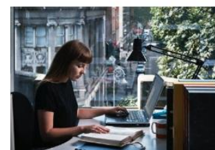
Library Supports >

Trinity has adopted a Reasonable Accommodation Policy that outlines how supports are implemented in Trinity College. Students seeking reasonable accommodation whilst studying in Trinity must apply for reasonable accommodations with the Disability Service via their student portal (my.tcd.ie). Based on appropriate evidence of a disability, and information obtained from the student on the impact of their disability and their academic course requirements, the Disability staff member will identify supports designed to meet the student's disability support needs. Following the Needs Assessment, the student's Disability Officer prepares an Individual Learning Educational Needs Summary (LENS) detailing the Reasonable Accommodations to be implemented. The information outlined in the LENS is communicated to the relevant School via the student record in SITS.