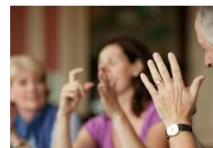
Managing Your Reasonable Accommodations >