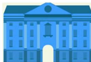
Reasonable Accommodations Group Sessions >