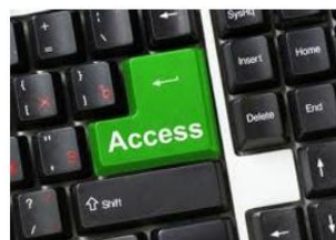
Assistive Technology >