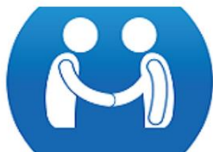
Deaf Supports in 3rd Level >