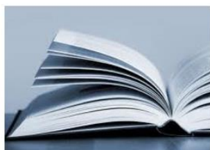
Academic Support >

The range of supports and resources provided by Trinity Disability Services are detailed here and illustrated below: https://www.tcd.ie/disability/support-and-resources/