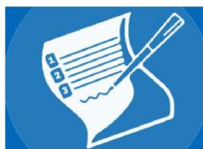
Exam Accommodations >